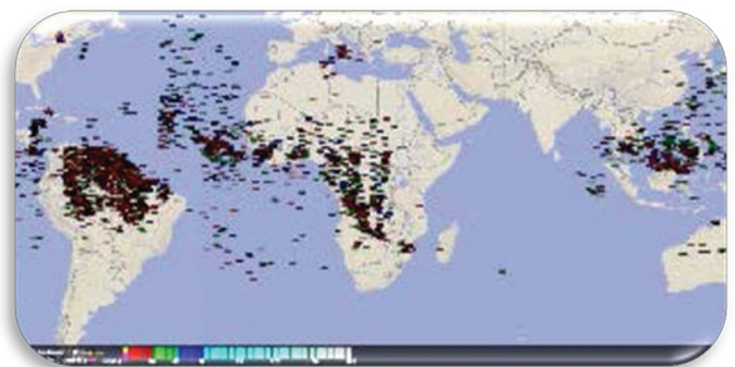
TLN provides continental scale total lightning detection over land and sea