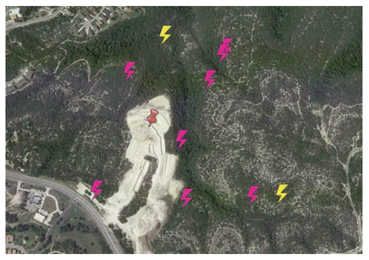
2:38:18 PM – The actual cloud-to-ground strike (yellow) that likely caused injuries is detected less than 300 meters away.

WeatherBug offered clients in the area <u>1 hour and 18 minutes of advanced warning</u>. There were no NWS alerts associated with this event.