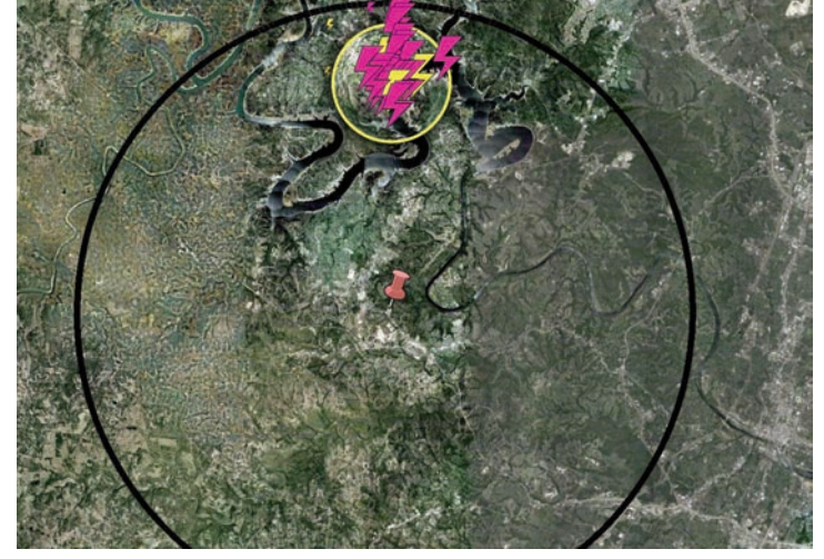
1:20-1:50 PM – The first in-cloud (magenta) and cloud-toground (yellow) lightning strikes occurs 10 miles of the construction site – 1 hour and 18 minutes prior to injuries

WHAT: Three injured in lightning strike near Bee Cave.WHERE: Bee Cave, TXWHEN: Monday, April 29, 2013