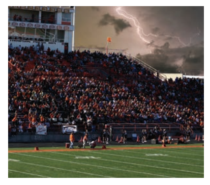
Receive the earliest possible warning of severe weather threatening your event.