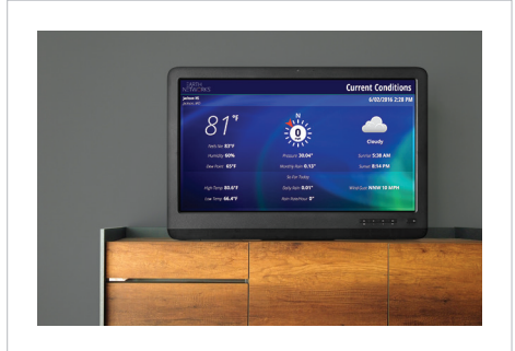
HD Weather Display

Guidance from trusted experts in the weather field